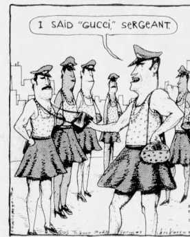
A stickler for consistency, Chief Edwards insisted on appropriate uniforms for his "Drag-net."

E-mail us: We'll be experimenting with the comics on this page, so let us know if they make you chuckle. Send an e-mail to starttime@star-telegram.com .